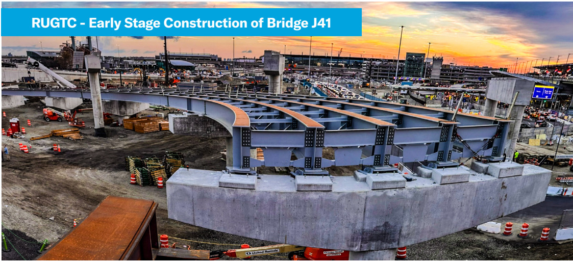
RUGTC - Early Stage Construction of Bridge J41