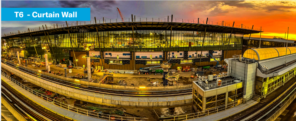
T6 - Curtain Wall

The attached picture shows ongoing frontage work such as metal wall panels and elevated roadway work.