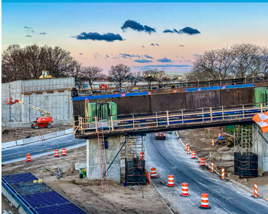
Bridge J34 West Abutment (behind) & J34 Pier 4