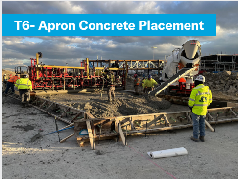
T6- Apron Concrete Placement

As far as the rest of 2025, Terminal 6 will continue with the work already mentioned, also include significant testing and commissioning of systems through the terminal. Operational Readiness, Activation, and Transition will begin at the end of 2025 and the Terminal 6 roadway frontage will be fully activated by the end of 2025.