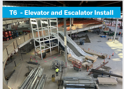
T6 - Elevator and Escalator Install