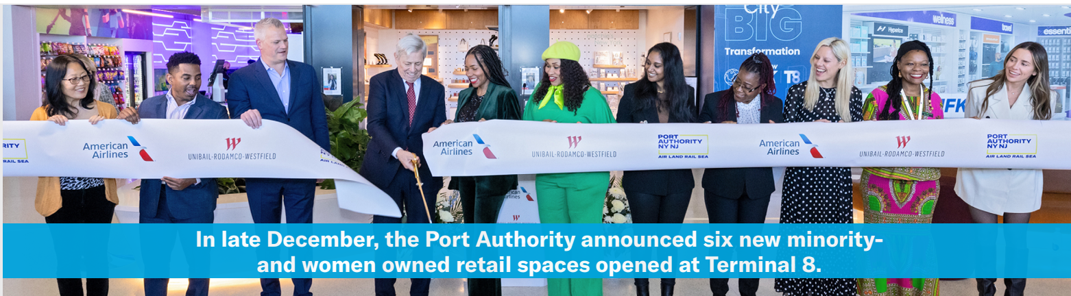
In late December, the Port Authority announced six new minority- and women owned retail spaces opened at Terminal 8.