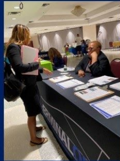
Allen Neighborhood Preservation & Development Corp. Job Fair (9/23)