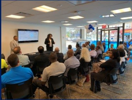
The New Terminal One Monthly Information Session: Site Mobilization (7/24, 8/22)