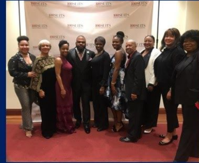
100 Suits for 100 Men 3 rd Annual Gala (10/19)